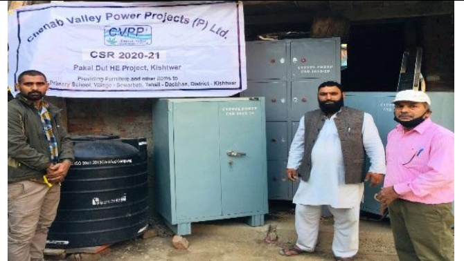
Govt. Upper Primary School, Sewarwati, Dachhan