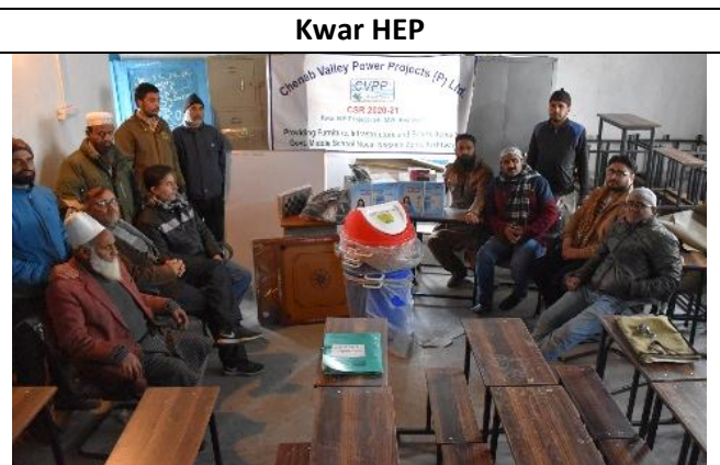
Govt. Middle School Noos, Village Bhagna