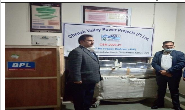
District Hospital Kishtwar