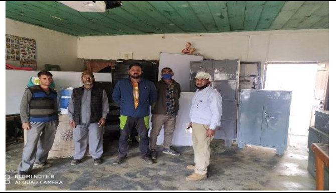
Govt. Girls Higher Secondary School, Sounder, Dachhan