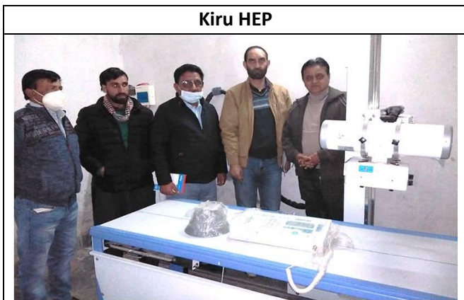
Primary Health Centre, Kiru