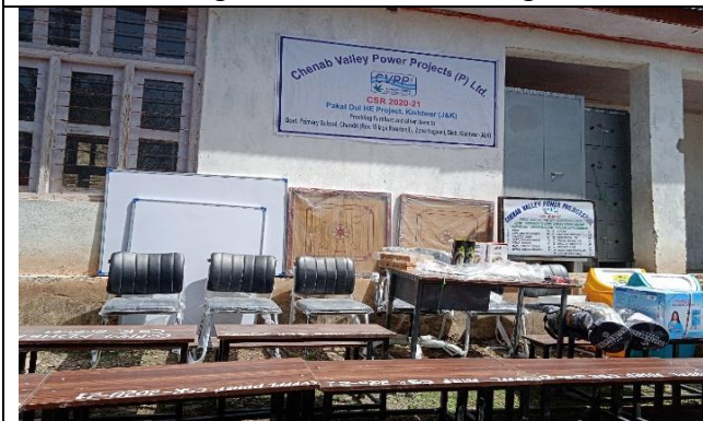
Govt. Primary School Chandri, Village Kwartanji