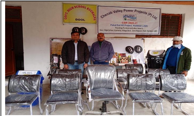
Govt. High School, Kuchalna, Village Dool