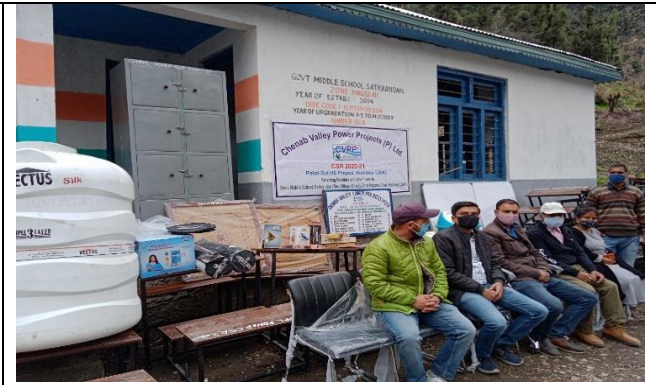
Govt. Middle School Satkrandan, Village Cherji