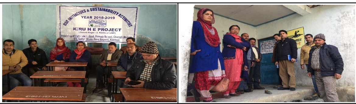
Handing over of items to Govt. Primary School Champli (Badole)