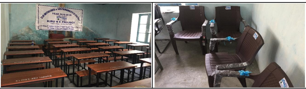
Utilisation of items in Govt. Primary School Champli (Badole)