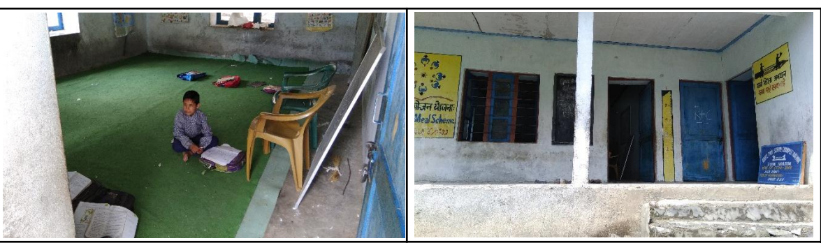
Govt. Primary School Champli (Badole) depicting pre activity scenario

Photographs of the CSR Activities implemented by Kiru HE Project in FY 2018-19