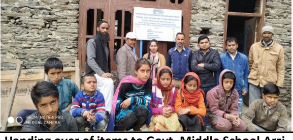
Handing over of items to Govt. Middle School Arzi, Zone Nagseni