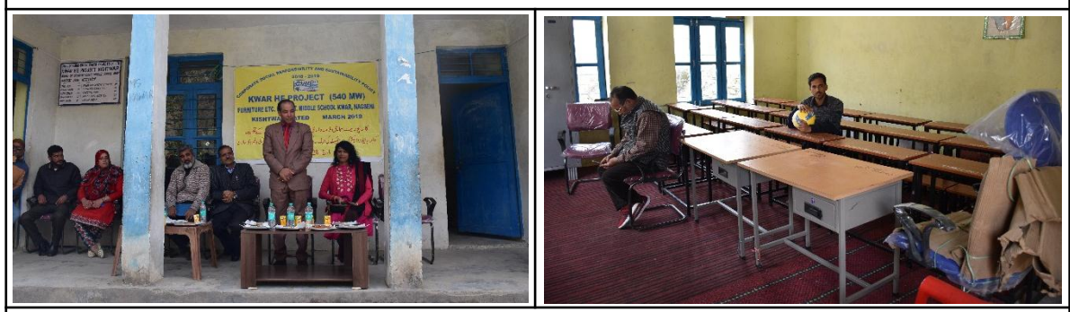
Handing over of items to Govt. Middle School Kwar

Govt. Middle School Kwar depicting pre activity scenario