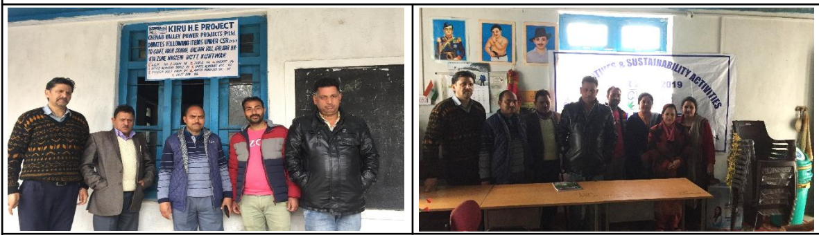
Handing over of items to Govt. High School, Galhar Bhata in presence of Naib Tehsildar, Nagseni