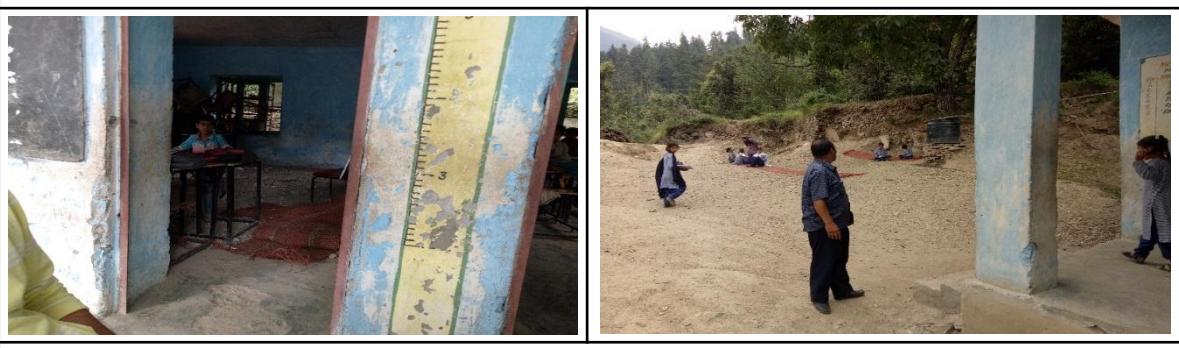
Govt Middle School Upper Bidda depicting pre activity scenario

Handing over of items to Govt. Middle School Kwar