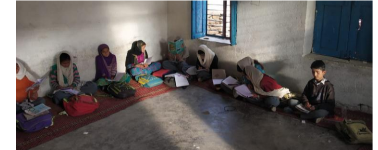
Govt. Middle School Janakpur, Dachhan, Kishtwar depicting pre activity scenario

Handing over of items to Govt. Middle School Arzi, Zone Nagseni and utilization of items in the school