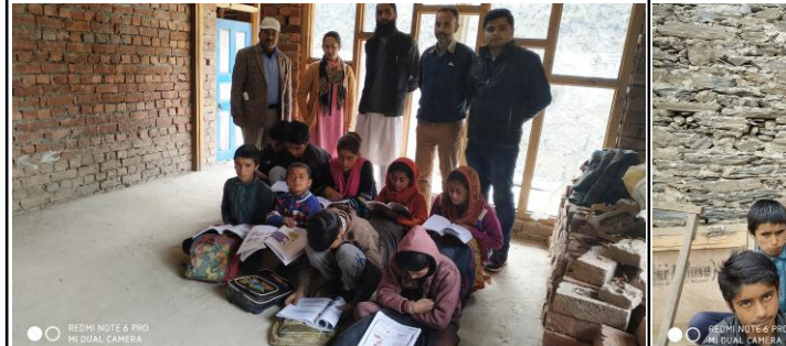
Govt. Middle School Arzi, Zone Nagseni depicting pre activity scenario