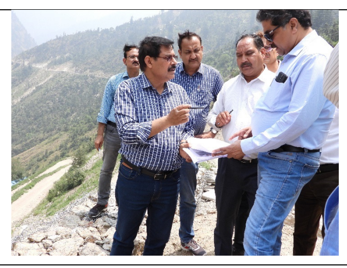
Inspection of Quarry sites