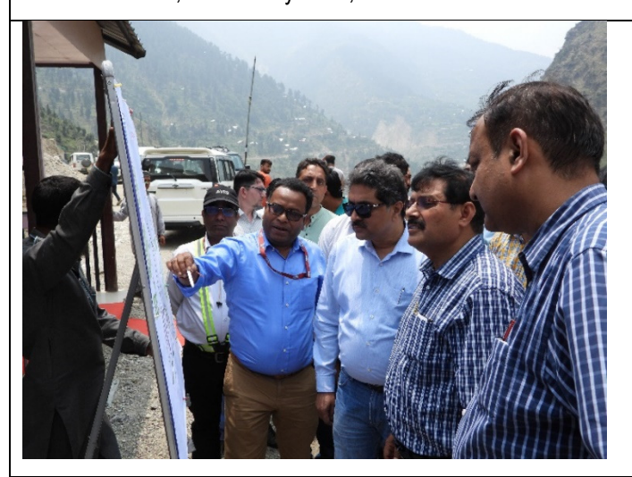
Briefing to MD, CVPPPL about construction activies