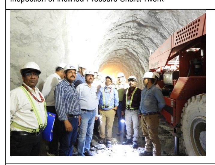
Inspection of Bottom Horizontal Pressure Shaft#4 work