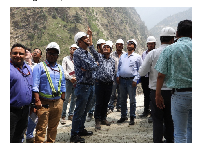
Inspection of Power Intake excavation work