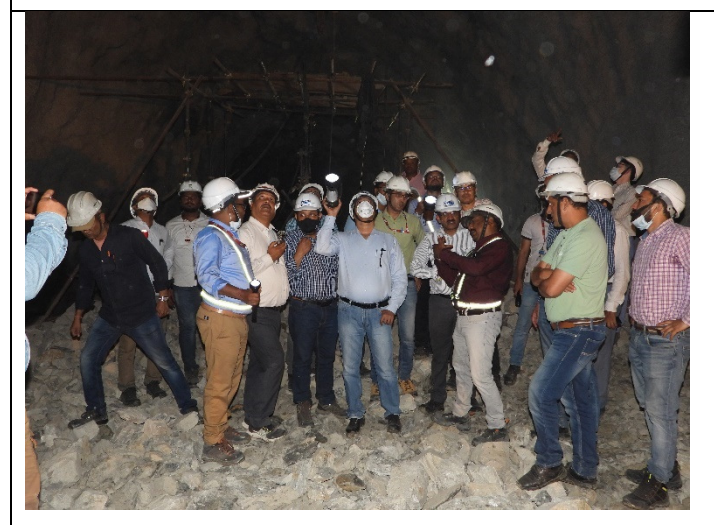
Inspection of Inclined Pressure Shaft#1work