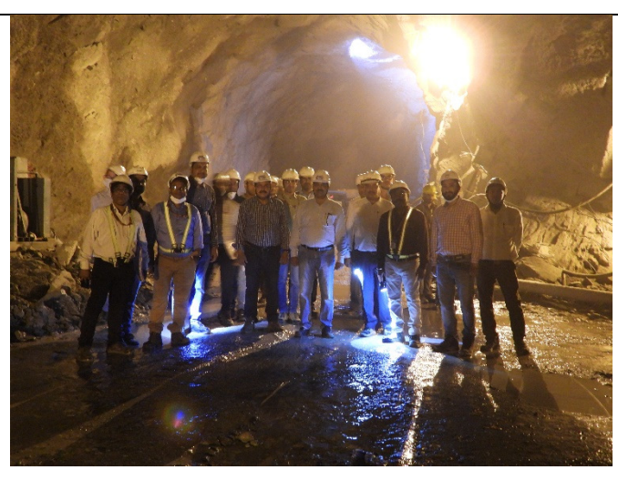
Inspection of APSB and Bottom Horizontal Pressure shaft work